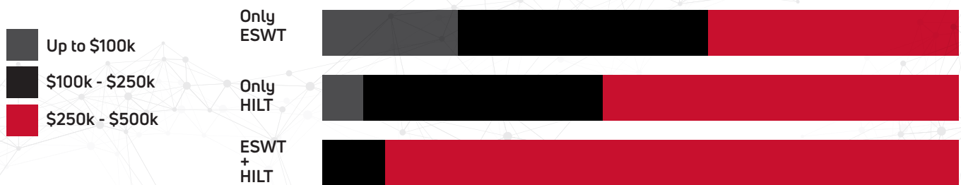
Annual revenue reported by clinic owners and operators after adding modalities to their practice.

90% of clinics with both modalities report annual revenues of over $250k